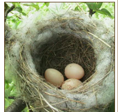
figure 1. a natural building

For more information: http://www.naturalbuildingtexas.org . Check back once a month or so as details are added.